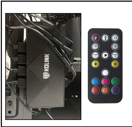
Included in the package: ARGB fan hub controller, remote control.