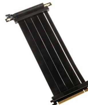
PCIE 4.0, RISER-CABLE 90° X16 220MM