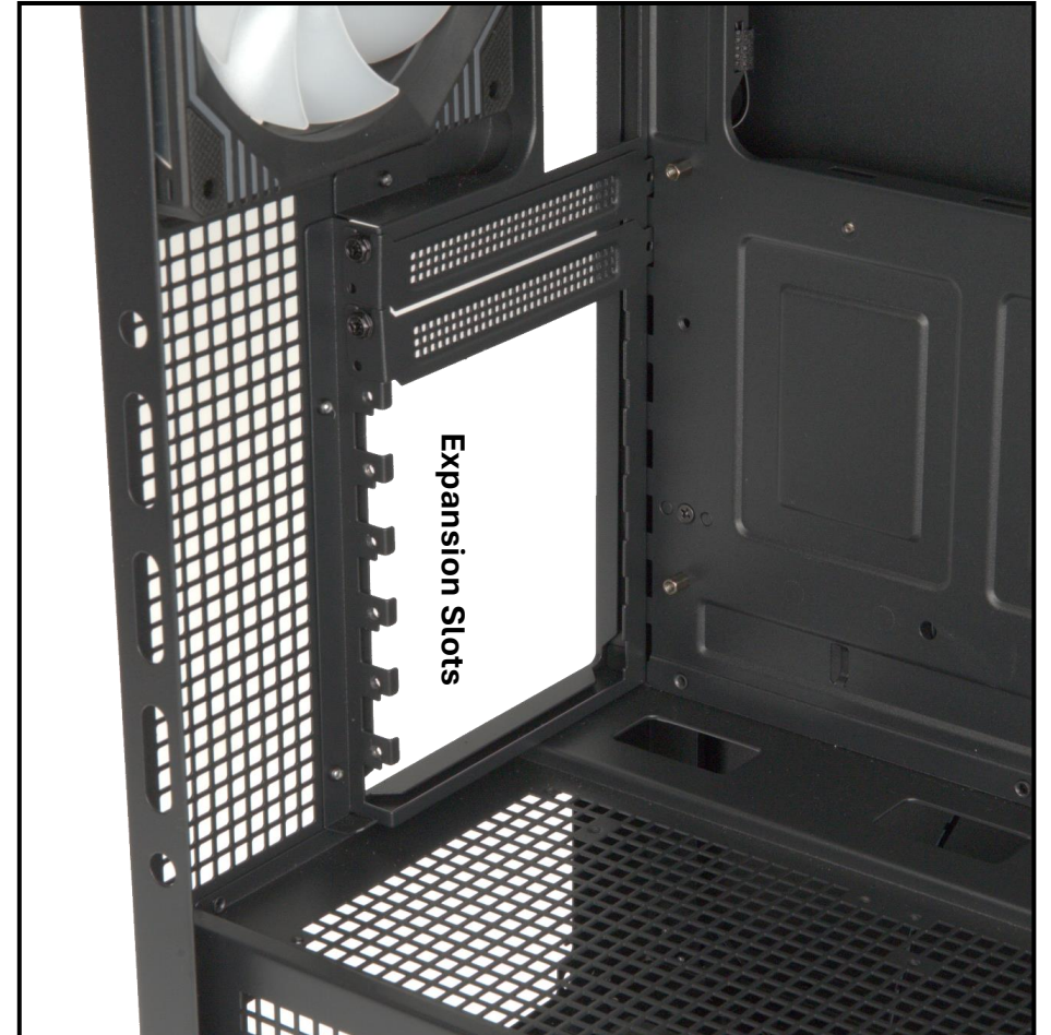
Remove 6 of the expansion slot covers at the preferred mounting position.