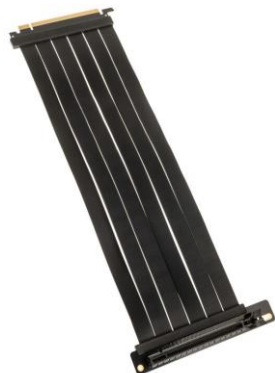
PCIE 5.0 RISER-CABLE 90° X16 300MM