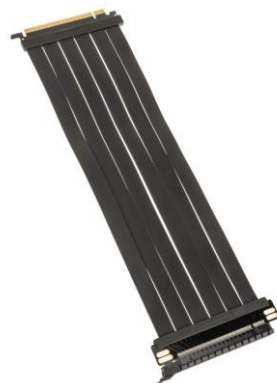
PCIE 5.0 RISER-CABLE 180° X16 300MM