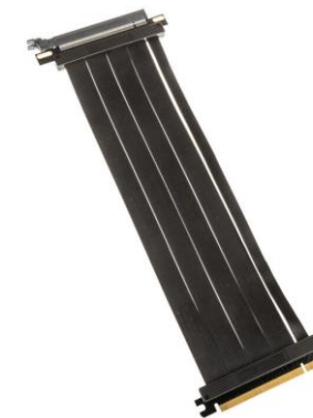
PCIE 4.0, RISER-CABLE 180° X16 300MM